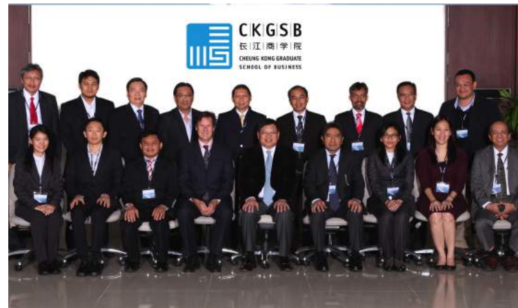
2012 AGLP Cheung Kong Graduate School of Business Group Photo