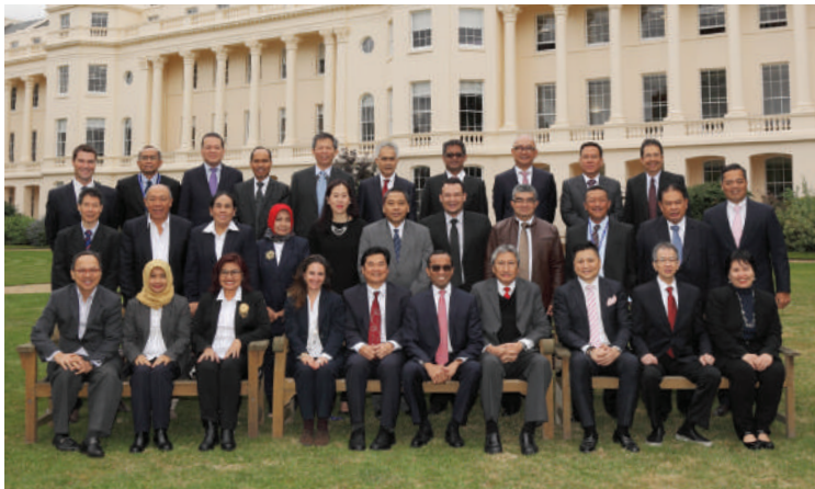
2016 AGLP London Business School Group Photo