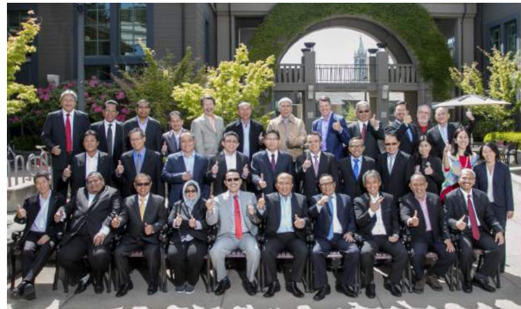
2016 AGLP UC Berkeley Haas School of Business AGLP Group Photo