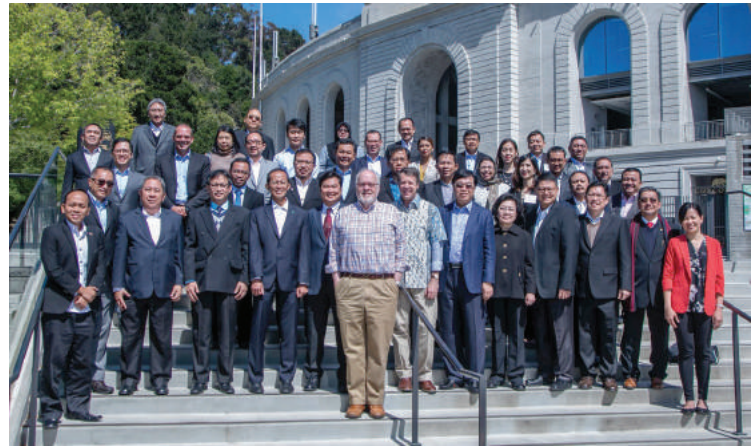
2017 AGLP UC Berkeley Haas School of Business Group Photo