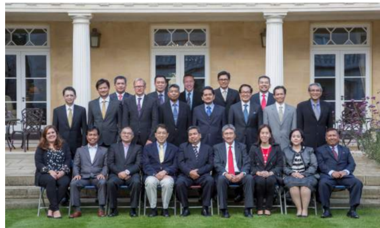
2014 AGLP Cambridge Judge Business School Group Photo