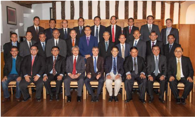
2018 AGLP Cambridge Judge Business School Group Photo