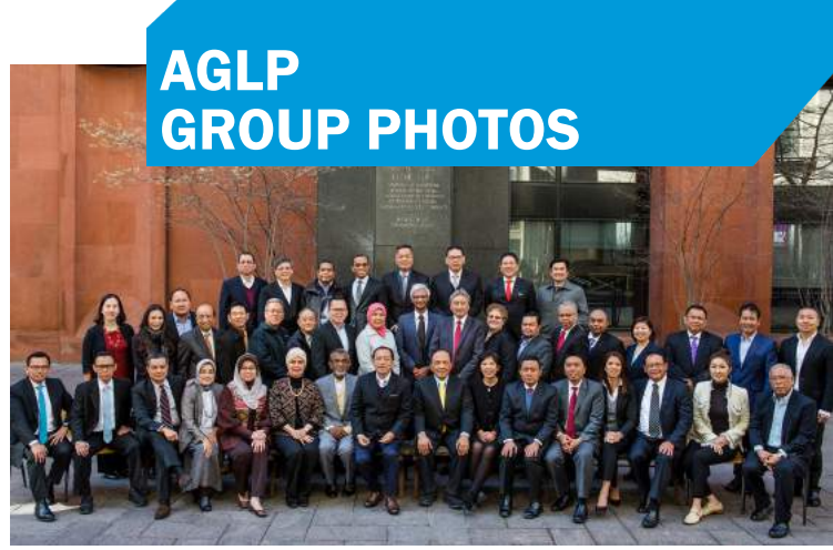
2018 AGLP New York University Stern School of Business Group Photo