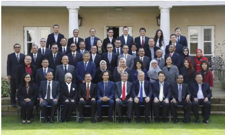
2017 AGLP Cambridge Judge Business School Group Photo