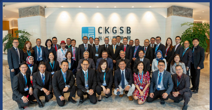
2019 AGLP Cheung Kong Graduate School of Business Group Photo