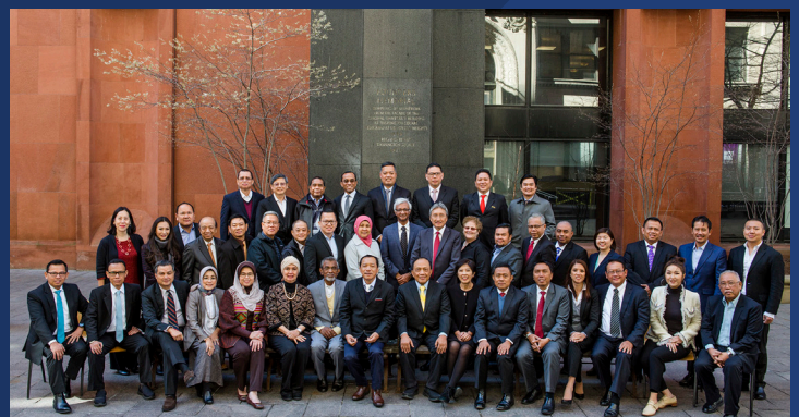
2018 AGLP New York University Stern School of Business Group Photo