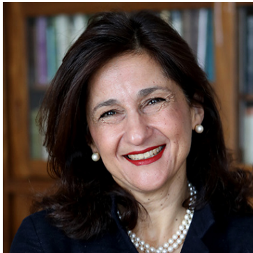
Dr Minouche Shafik DBE