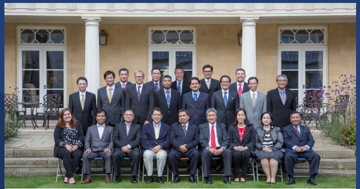
2014 AGLP Cambridge Judge Business School Group Photo