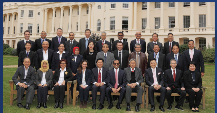
2016 AGLP London Business School Group Photo