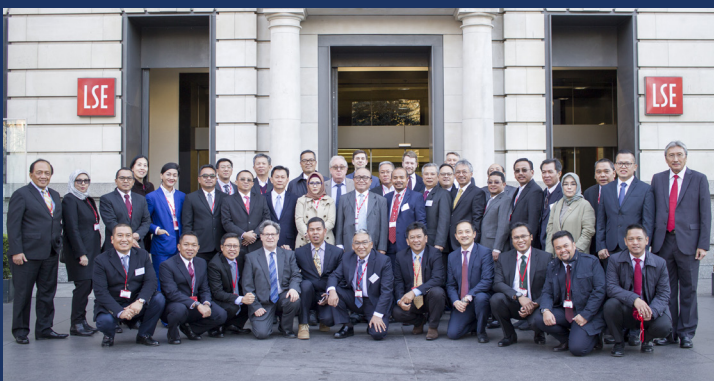
2019 AGLP London School of Economics and Political Science Group Photo