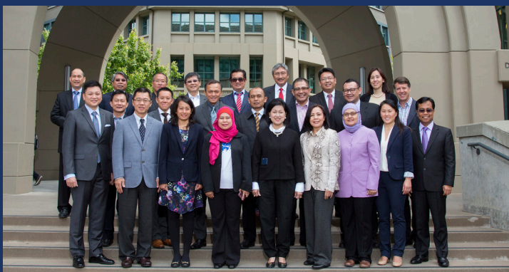
2015 AGLP UC Berkeley Haas School of Business Group Photo