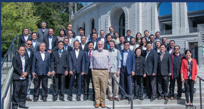
2017 AGLP UC Berkeley Haas School of Business Group Photo