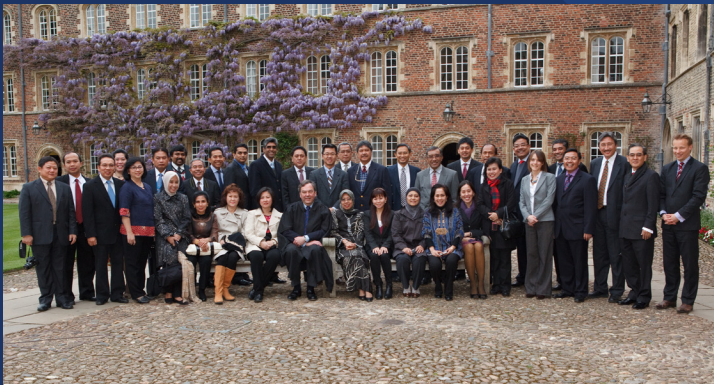
2011 AGLP Cambridge Judge Business School Group Photo